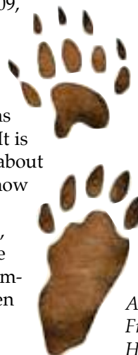
Actual skunk paw print size: Front-1 3/4" Tall x 1 3/4", Hind-2 5/8" Tall x 1 1/2"

Myth – relocating any wild animal is illegal because it spreads diseases to other populations, shifts the problem to someone else, and usually causes the death of the animal.